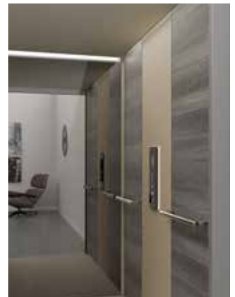
MIRROR: FULL WALL