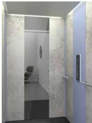
MIRROR: SLIM VERTICAL