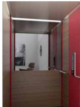
MIRROR: HALF WALL