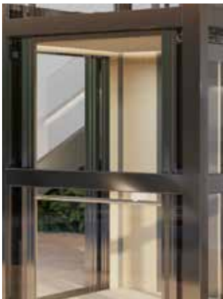
FULL/HALF GLASS WALL

These options are available on both Simplicity and Deluxe cabins and can be fitted on any side of the cabin except for the control panel side or the door sides.